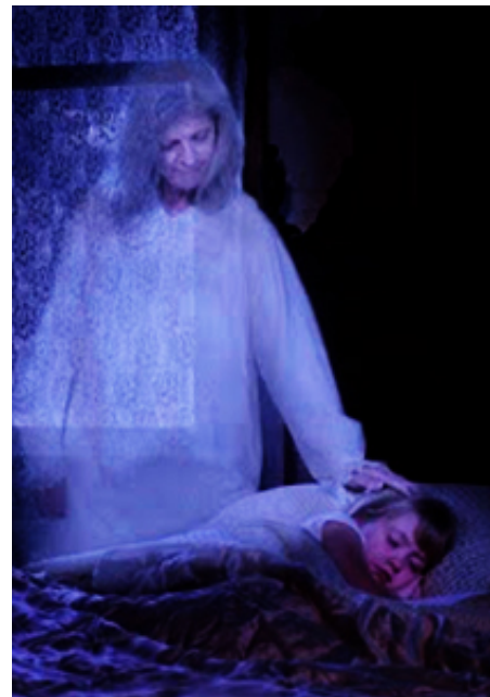
A Grandmother watching over a grandchild.

In cases such as these, the spirit feels they can't wholly leave the earth plane until they do so and will cross back from the plane of spirits in an attempt to complete their mission. These spirits may even become stuck and might forget why they came back in the first place. When seen, they could appear as though they are trying to communicate something desperately, but no voice is perceived.