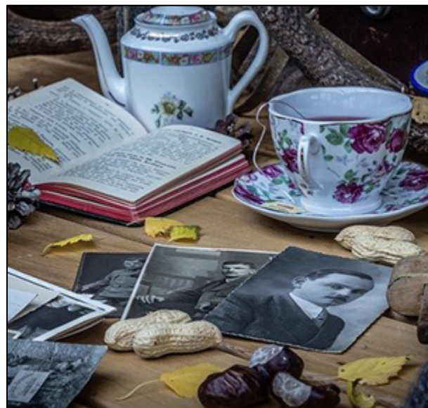
RESEARCH IS CRITICAL

Finally, researching information about an alleged haunted site takes a bit of work but is well worth the effort. Talk to the victims of the haunting you are investigating. Libraries and historical societies are excellent for this. While it's true that you, or a team member, may have to scroll through newspapers, magazines, or blogs on the Internet, some of these media