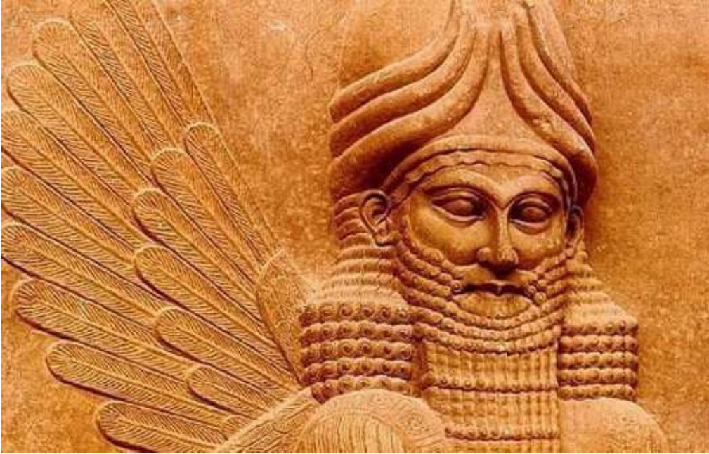
Above: The depiction of the winged being the Sumerians called, “The Anunnaki.”

I n recent years, acceleration in the belief and importance of Angels has once again become popular. Adding to this, many books have been written about Angel interventions. Basically, these days, the subject of Angels has become a cottage industry.