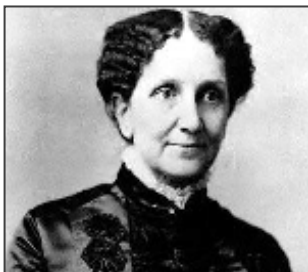
Left: The founder of the Christian Science movement, Mary Baker Eddy. Eddy described Angels as "celestial visitants, flying on the spiritual, not material. Angels are pure thoughts of God, winged with Truth and Love."