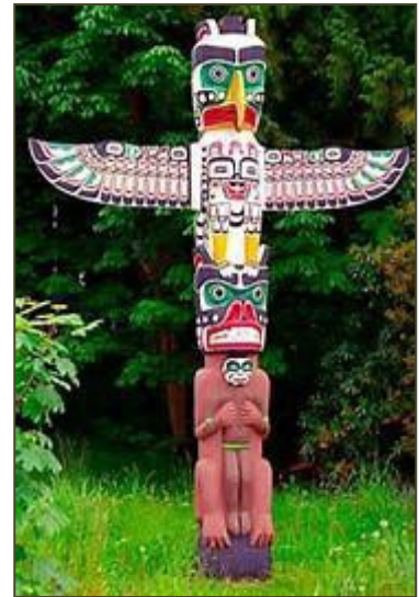
Indigenous Totem Found in Alaska

Angels will appear in ways which are familiar to us. For example, if a Caucasian-looking Angel appears to someone of Japanese ancestry, they may not be recognized as an Angel. In other examples, Angels have been reported as being Black. As for North American Indians or remote indigenous cultures, they might even appear as a power animal, or even a God-like totem figure that is known to that culture. Very often, Angels have even been depicted as some kind of fearsome creature. Evidence of this is found in various cultures worldwide. (See right.)