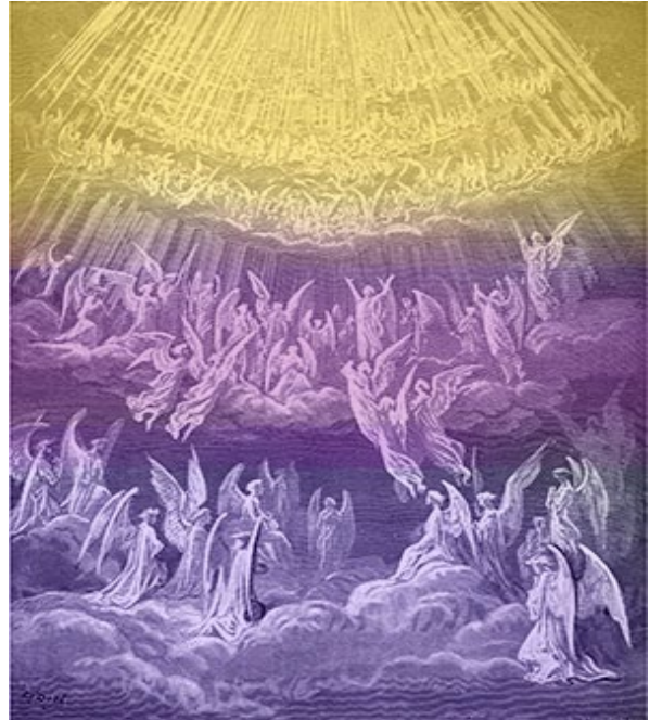
Painting: Celestial Hierarchy of Angels